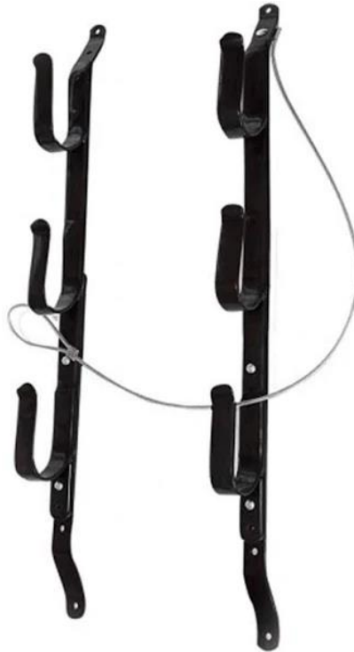
Lockable Gun Rack